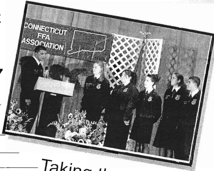
Taking the Oath

Connecticut State FFA Conference June 2, 2007 Suffield